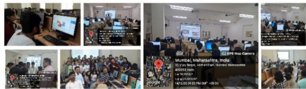
Entrepreneurship Development workshops with schools & colleges