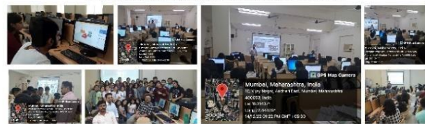
Entrepreneurship Development workshops with schools & colleges

Prototyping designing & 3D printing workshops