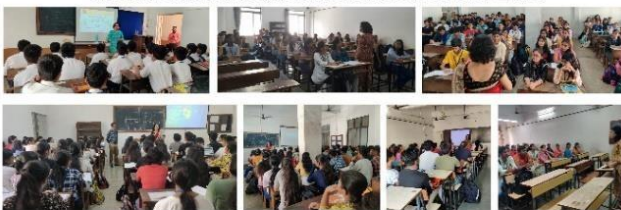
Ideation workshops with schools & colleges

PTVAIM's COEI team started promotional activities in all the schools and colleges of PTVA from November 2022.