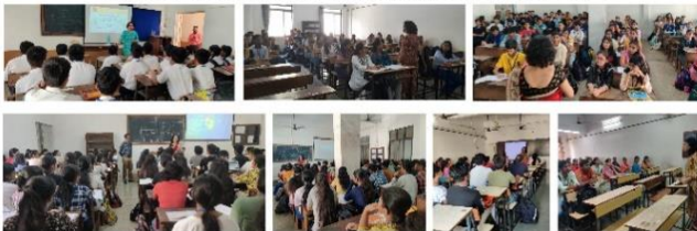
Ideation workshops with schools & colleges