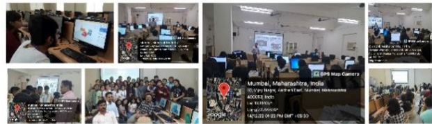
Entrepreneurship Development workshops with schools & colleges