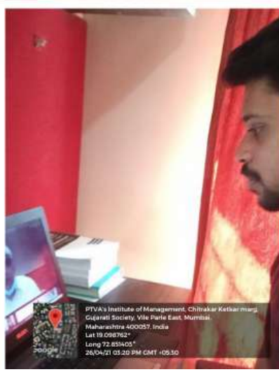
PTVA's Institute of Management, Chitrakar Ketkar marg, Gujarati Society, Vile Parle East, Mumbai, Maharashtra 400057, India Lat 19.098762 * Long 72.851403 * 26/04/21 03:20 PM GMT +05:30