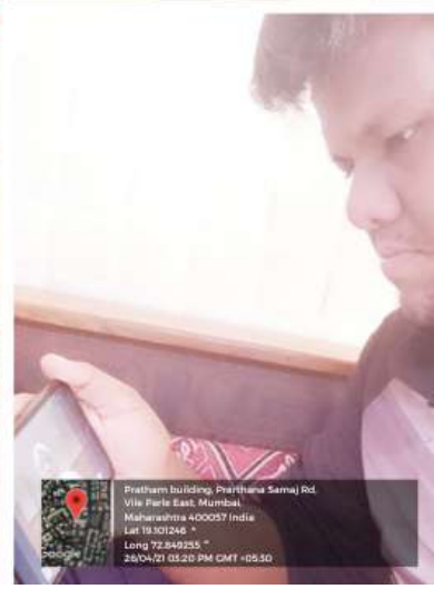
Pratham Building, Prarthana Samaj Rd, Vile Parle East, Mumbai, Maharashtra 400057 India Lat 19.101246 * Long 72.849255 * 26/04/21 03:20 PM GMT +05:30