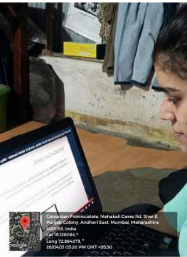
Candolim Provinciate, Mahakali Caves Rd, Sher B Rangoli Colony, Andheri East, Mumbai, Maharashtra 400055, India Lat 19.126084 * Long 72.864279 * 26/04/21 03:20 PM GMT +05:30