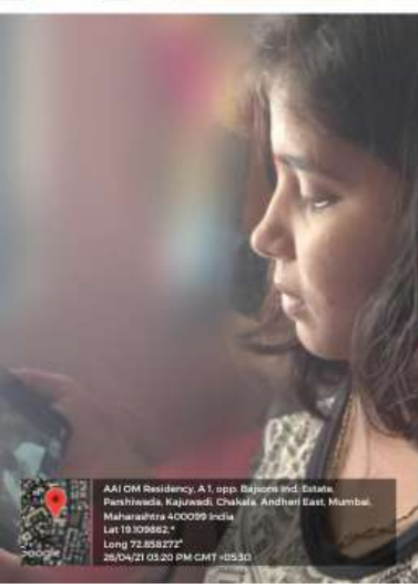
AAI DM Residency, A I opp Bajaj Ind Estate, Panthraoda Rajwadi, Chakola, Andheri East, Mumbai, Maharashtra 400099 India Lat 19.109882 * Long 72.858272 * 26/04/21 03:20 PM GMT +05:30