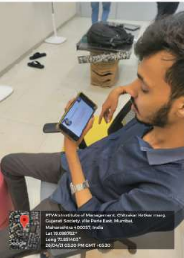
PTVA's Institute of Management, Chitrakar Ketkar marg, Gujarati Society, Vile Parle East, Mumbai, Maharashtra 400057, India Lat 19.098762 * Long 72.851403 * 26/04/21 03:20 PM GMT +05:30