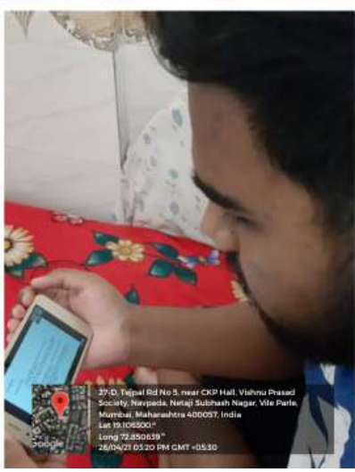
35'D, Tejpal Rd No 3, near DSD Hall, Vishnu Dhasad Society, Navpada, Near Subhash Nagar, Vile Parle, Mumbai, Maharashtra 400057, India Lat 19.105800 * Long 72.850639 * 26/04/21 03:20 PM GMT +05:30