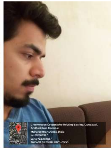
Greenwoods Cooperative Housing Society, Gundavali, Andheri East, Mumbai, Maharashtra 400057, India Lat 19.116691 * Long 72.858783 * 26/04/21 03:20 PM GMT +05:30