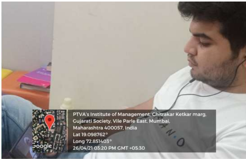
PTVA's Institute of Management, Chitrakar Ketkar marg, Gujarati Society, Vile Parle East, Mumbai, Maharashtra 400057, India Lat 19.098762 ° Long 72.851403 ° 26/04/21 03:20 PM GMT +05:30