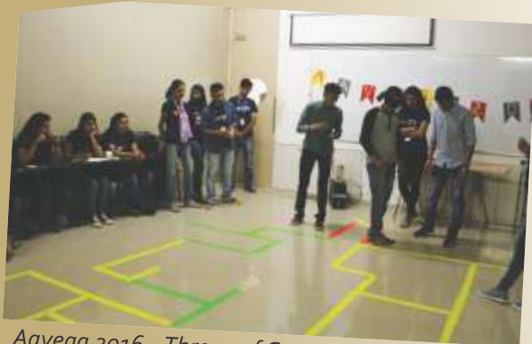
Aavega 2016 – Throne of Games & Dance Fiesta