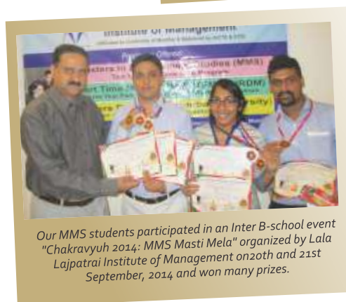
Our MMS students participated in an Inter B-school event "Chakravyuh 2014: MMS Masti Mela" organized by Lala Lajpatrai Institute of Management on 20th and 21st September, 2014 and won many prizes.