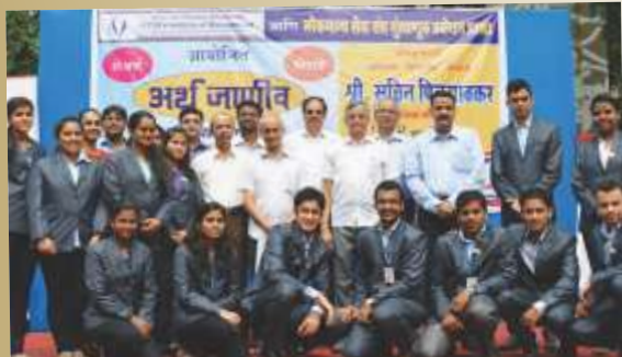
"ArthJaniv"...the Finance Exhibition