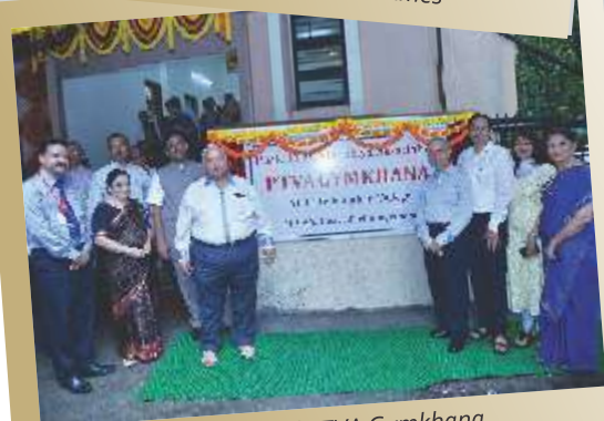
Inauguration of PTVA Gymkhana