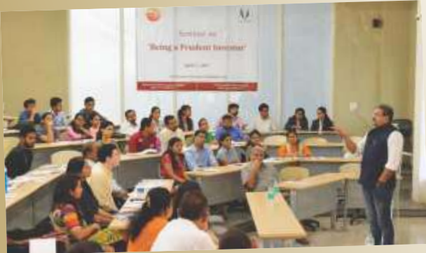
Workshop on "Being a Prudent Investor" in association with NSDL