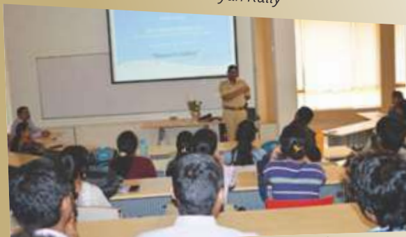
Women's Day 2015 was marked by a session on "Women's Safety"