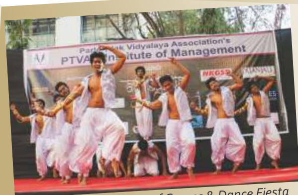
Aavega 2016 – Throne of Games & Dance Fiesta