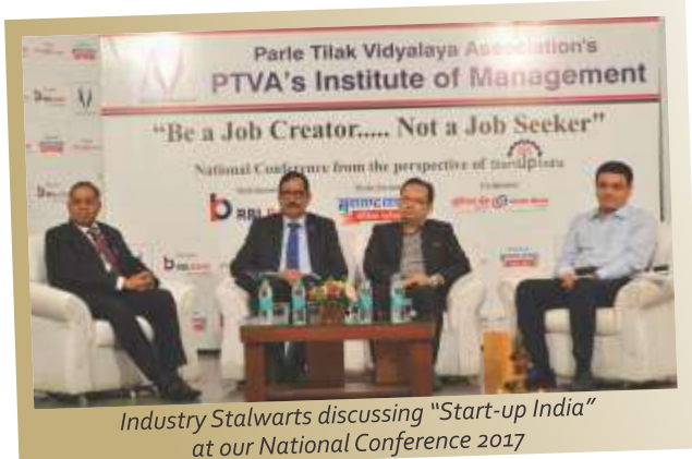
Industry Stalwarts discussing "Start-up India" at our National Conference 2017