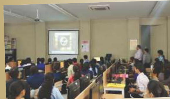
L & T Infotech Placement Drive