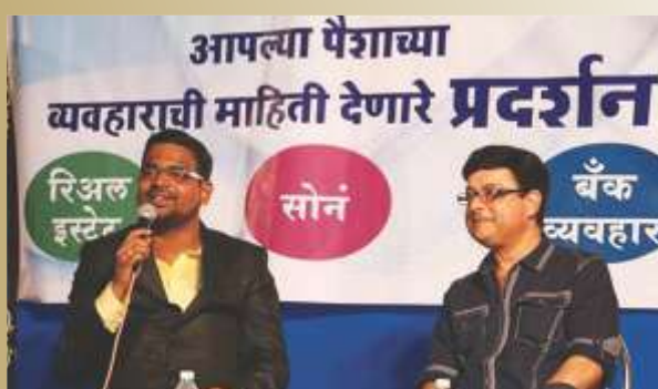
Arth Janiv 2015