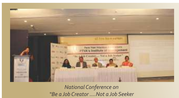
National Conference on "Be a Job Creator .... Not a Job Seeker"