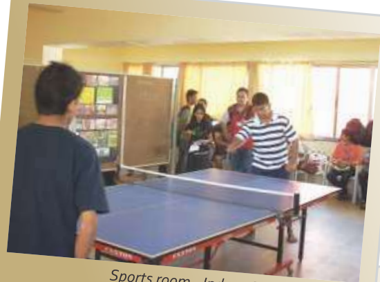
Sports room - Indoor Games