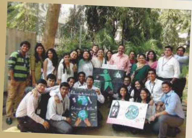
Director, Faculty Members & Students at the Environment Rally