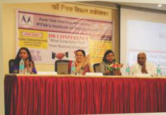
HR Conference on - 'What Corporates Want from Business Graduates'