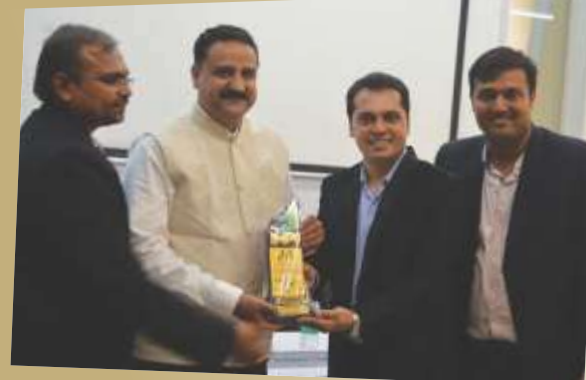
"MARKET NITI 2016", a Plan & Play the Stock Market Game