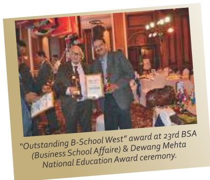
"Outstanding B-School West" award at 23rd BSA (Business School Affaire) & Dewang Mehta National Education Award ceremony.