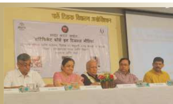
Certificate Course in Regional Media in association with Madhyam 360