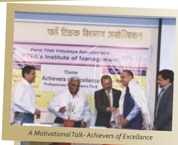
A Motivational Talk- Achievers of Excellence