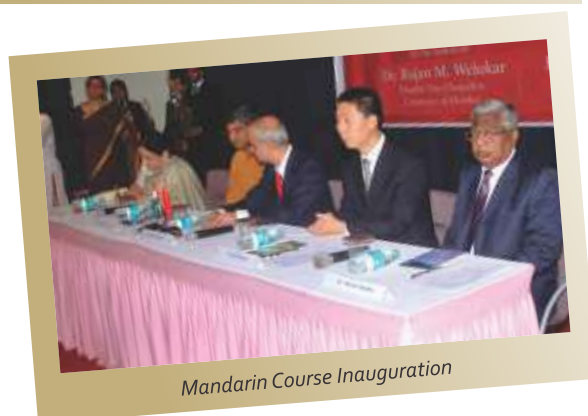
Mandarin Course Inauguration