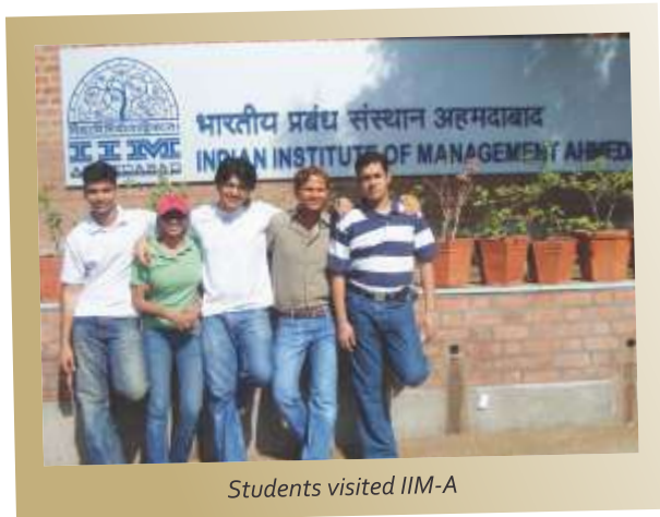
Students visited IIM-A