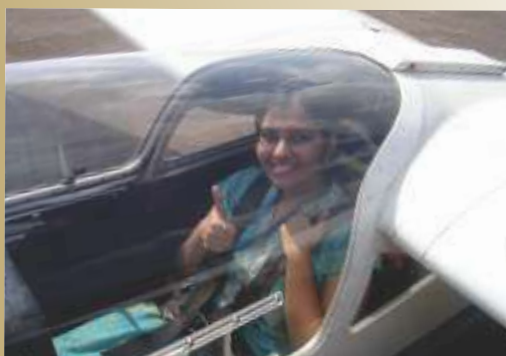
Industrial Visit to Nashik