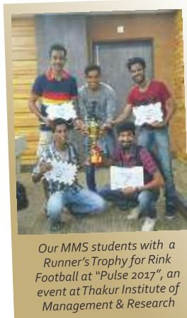
Our MMS students with a Runner's Trophy for Rink Football at "Pulse 2017", an event at Thakur Institute of Management & Research