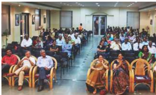
Well Equipped Auditorium