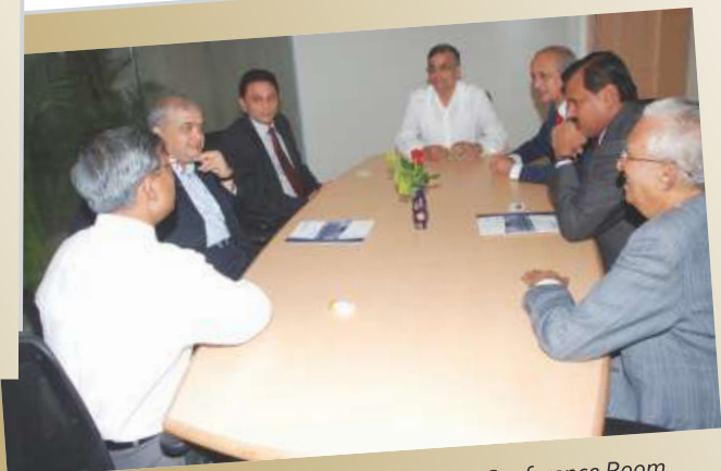
Advisory Board Members with Guests in Conference Room