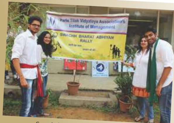
Swachh Bharat Abhiyan Rally