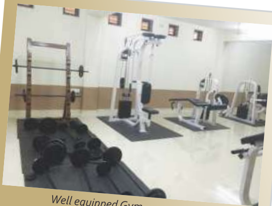
Well equipped Gym