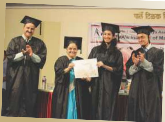
Degree Distribution Ceremony 2015