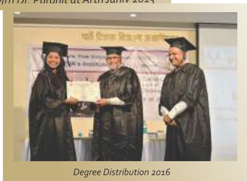
Degree Distribution 2016