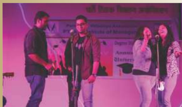
Alumni Meet Function