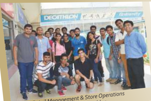
Retail Management & Store Operations Study Tour at Decathlon,