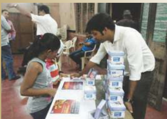
Our MMS student with his innovative product, Sanskar Puzzle