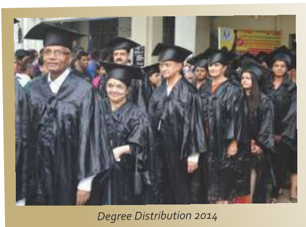
Degree Distribution 2014