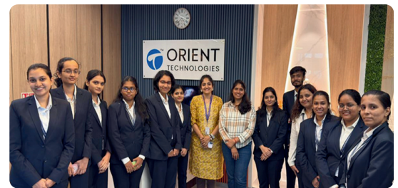
Visit to Orient Technologies Ltd.