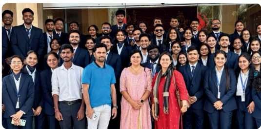
Visit to AMUL Virar Dairy

They also encourage networking with industry experts, giving students valuable insights into career pathways and emerging trends.