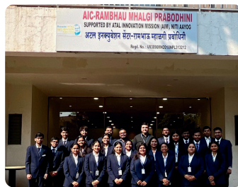
Visit to ATAL INCUBATION CENTRE - RMP